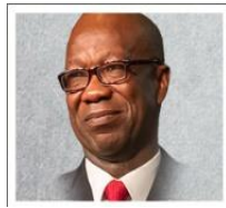
Bishop Hilliard Dogbe Western West Africa