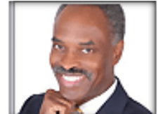
Bishop Staccato Powell Western