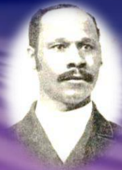
Bishop C.C. Pettey Organized the North Alabama Conference in 1894